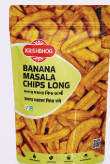
BANANA MASALA CHIPS LONG