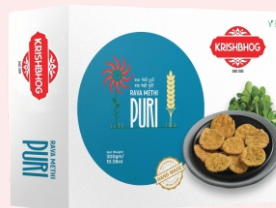
RAVA METHI PURI