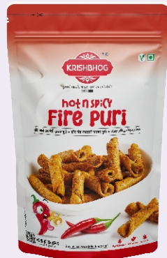
HOT N SPICE PURI