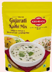
GUJARATI KADHI MIX