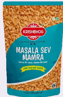
MASALA SEV MAMRA