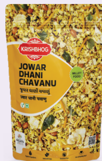
JOWAR DHANI CHAVANU