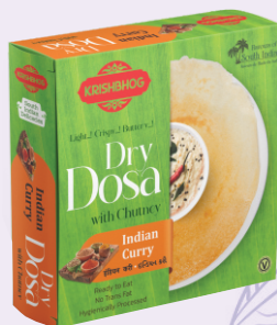
INDIAN CURRY DRY DOSA