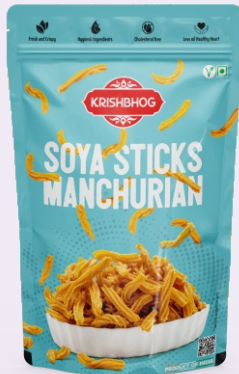
SOYA STICKS MANCHURIANS