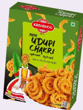
MASALA UDUPI CHAKRI