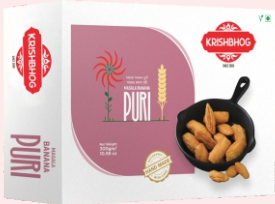
MASALA BANANA PURI