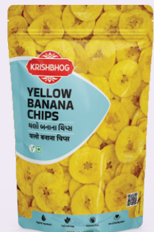
YELLOW BANANA CHIPS