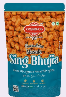
MASALA SING BHUJIYA