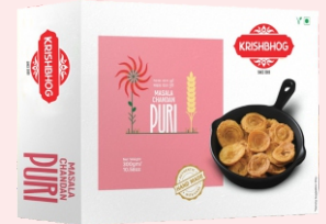
MASALA CHANDAN PURI