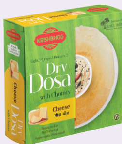
CHEESE DRY DOSA