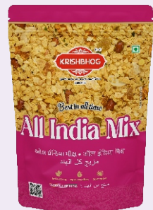
ALL INDIA MIX