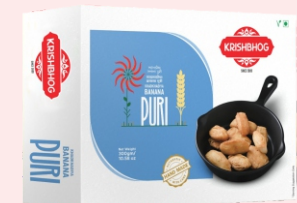
KHADKHADIYA BANANA PURI