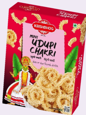
PLAIN UDUPI CHAKRI