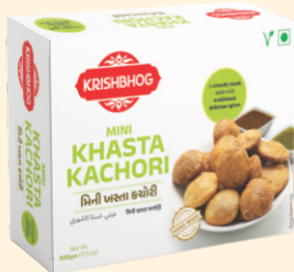
MINI KHASTA KACHORI