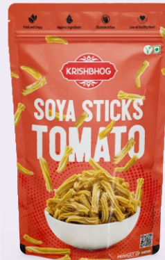
SOYA STICKS TOMATO