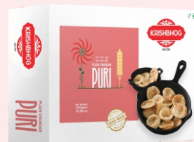
PLAIN CHANDAN PURI