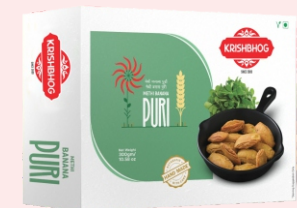
METHI BANANA PURI