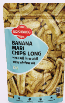
BANANA MARI CHIPS LONG