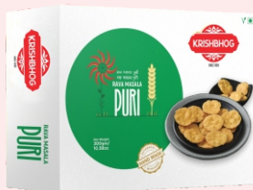
RAVA MASALA PURI