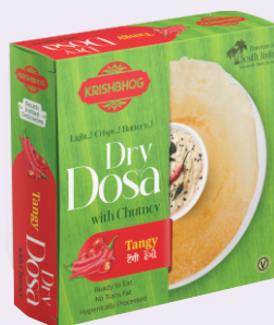
TANGY DRY DOSA