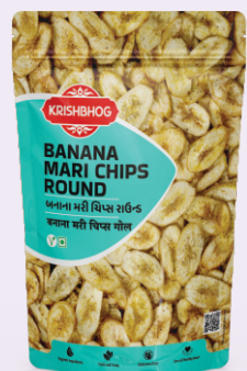
BANANA MARI CHIPS ROUND