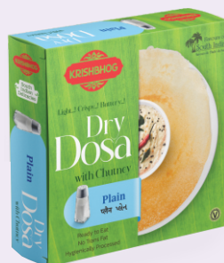
PLAIN DRY DOSA