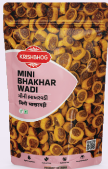
MINI BHAKHAR WADI