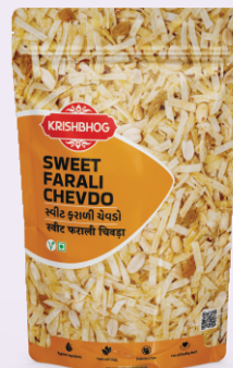
SWEET FARALI CHEVDO