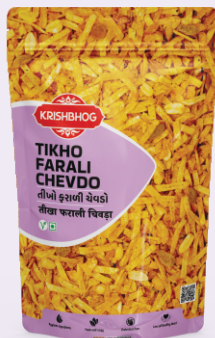
TIKHO FARALI CHEVDO