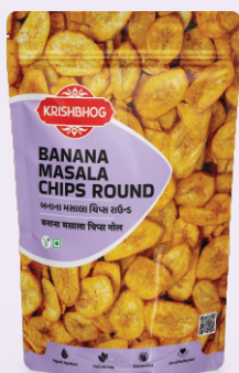
BANANA MASALA CHIPS ROUND