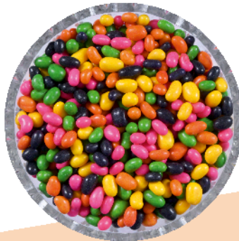
Tinni Mini Big (Sugar Coated Saunf)