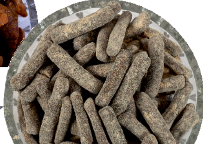
Aam Rochak (Khatta)