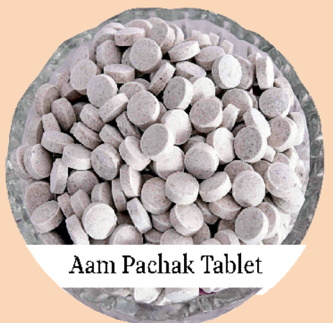
Aam Pachak Tablet