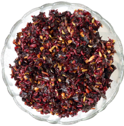
Calcutta Meetha Paan