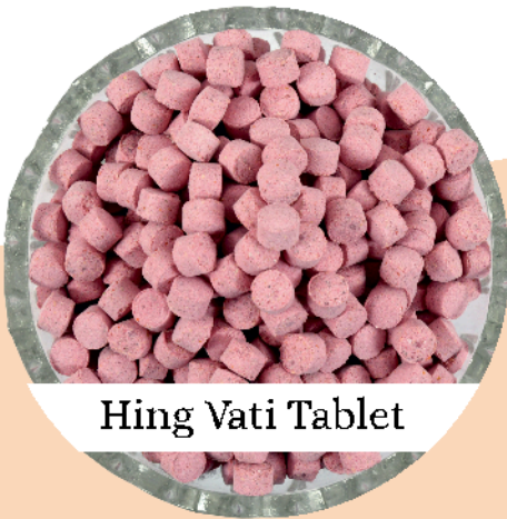
Hing Vati Tablet