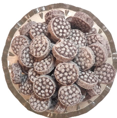
Kali Mirch Candy