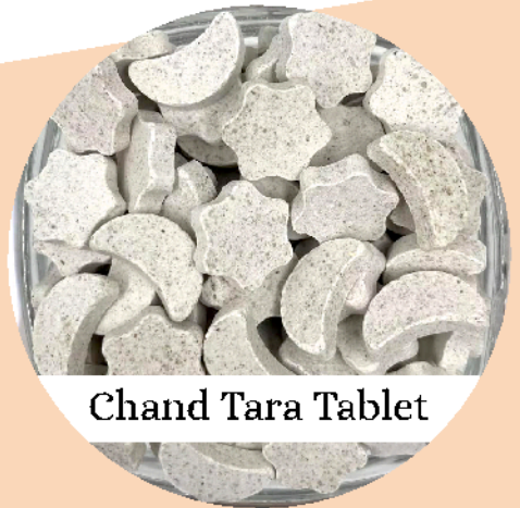
Chand Tara Tablet