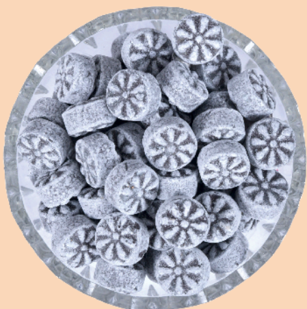
Kala Khatta Candy