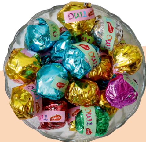
Thanda Meetha Paan