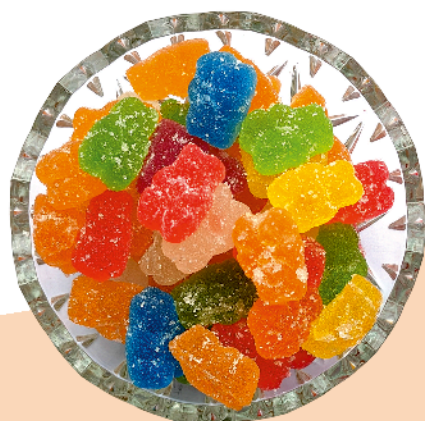
Teddy Bear Jelly