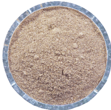
Pathar Hajam Churan