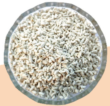
Madrasi Saunf White