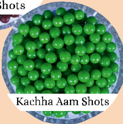
Kachha Aam Shots