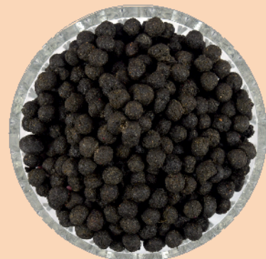
Gaslin (Gas Haran Vati)