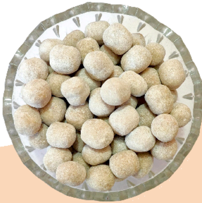
Aalu Bukhara Goli