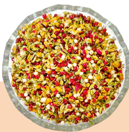
Khus Mix (Special )