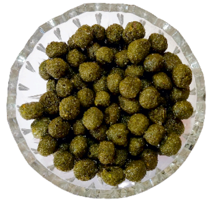
Kaccha Aam Goli