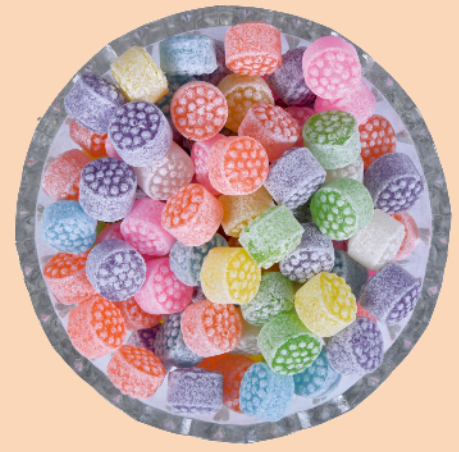
Mix Flavor Candy