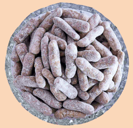
Aam Rochak (Meetha)