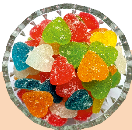
Little Heart Jelly