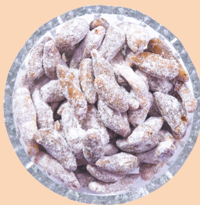
Chhuhara Pachak (Meetha)