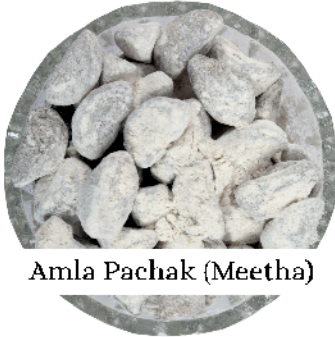
Amla Pachak (Meetha)