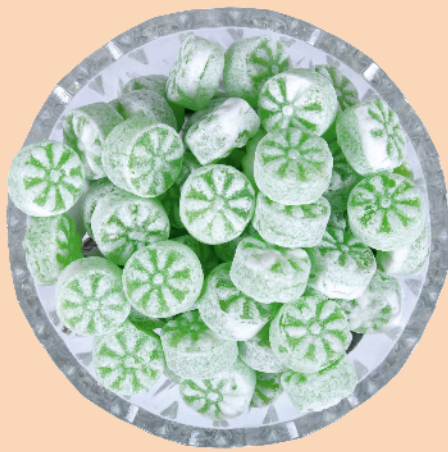
Kaccha Aam Candy