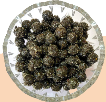
Kala Khatta Goli