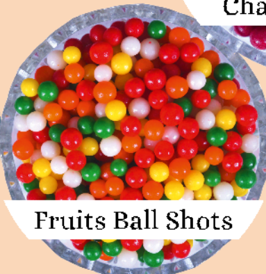
Fruits Ball Shots