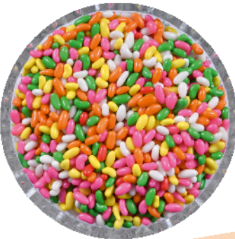
Tinni Mini Small (Sugar Coated Saunf)