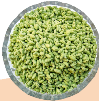
Madrasi Saunf Green