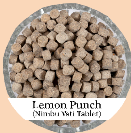
Lemon Punch (Nimbu Vati Tablet)