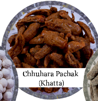
Chhuhara Pachak (Khatta)