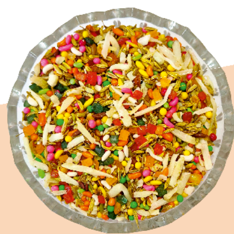
Shahi Mewa Mix