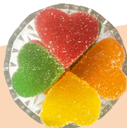
Big Heart Jelly