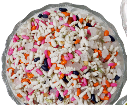
White Magic Mix

Mouth fresheners, commonly known as mukhwas in India, are extensive preparations of various Indian herbs to suit the taste palate. These mouth fresheners are consumed widely as they are a preferred necessity post meals.