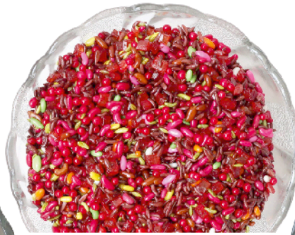
Shahi Gulab Mix